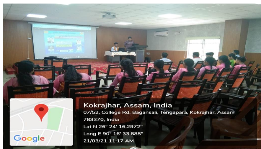
Scene of Webinar conducting from Seminar Hall, K.G.C.