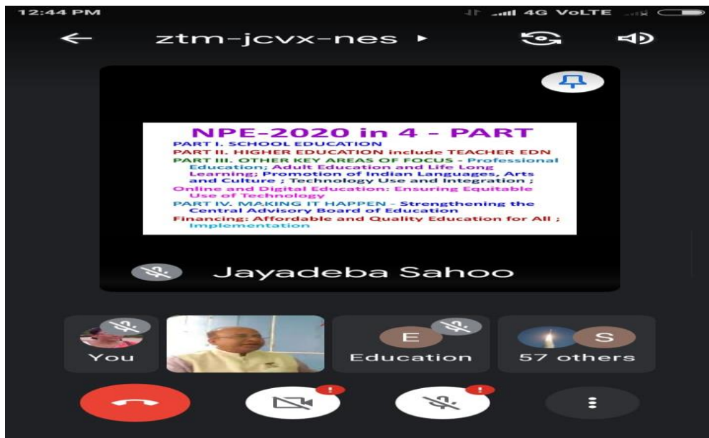
Some glimpses of “National Webinar on National Education Policy, 2020” organized by Department of Education, Kokrajhar Govt. College.