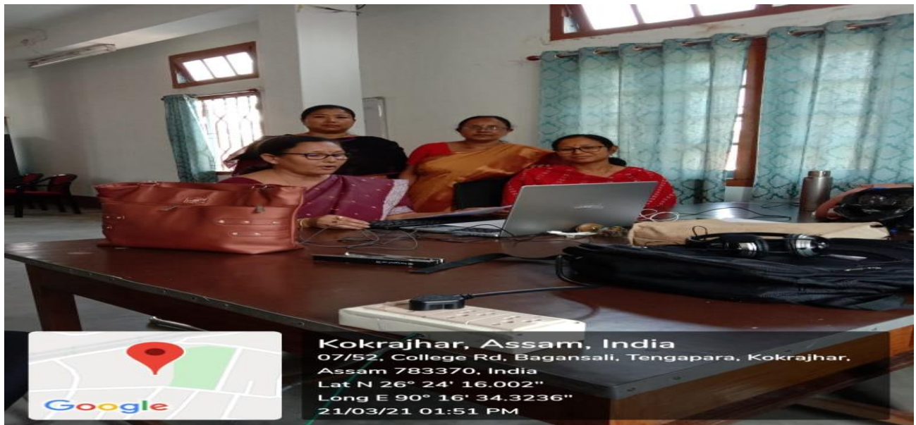
Some glimpses of “National Webinar on National Education Policy, 2020” organized by Department of Education, Kokrajhar Govt. College.