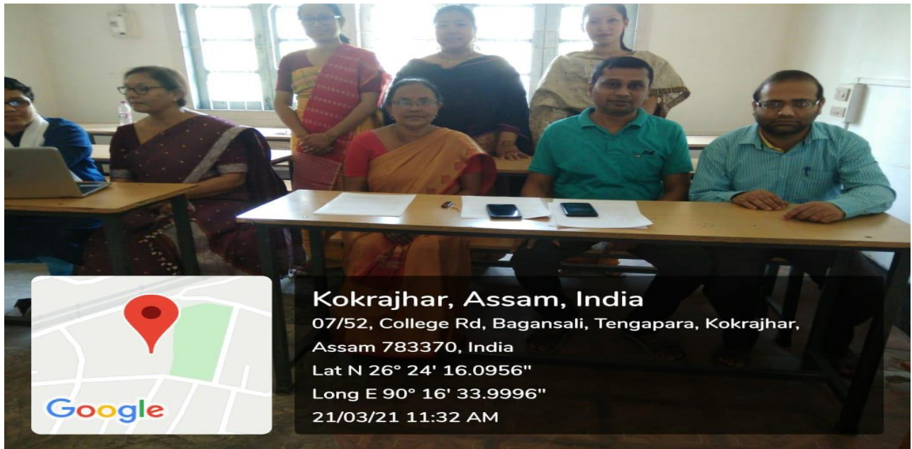
Some glimpses of “National Webinar on National Education Policy, 2020” organized by Department of Education, Kokrajhar Govt. College.